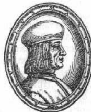
Aldus Manutius, from Book Published 1575.